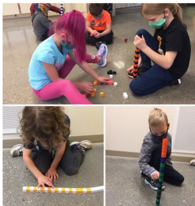
Making patterns in grade ½

School Picture Retake Day is Thursday, November 5.